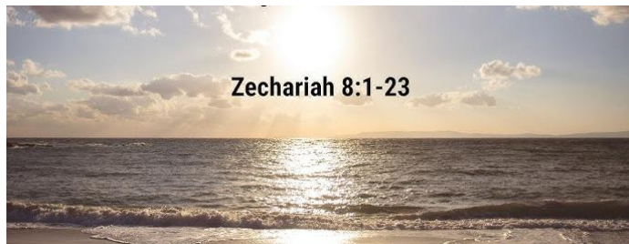
“But God...” Zechariah 8

Morning Worship @ 10:00 AM Children’s Worship -During the service Sunday School & Catechism– 11:15 AM Refreshments and fellowship following the service.