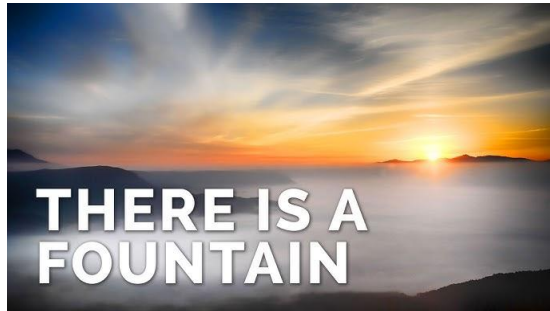
“There Is a Fountain” Zechariah 13

Refreshments and fellowship following the service.